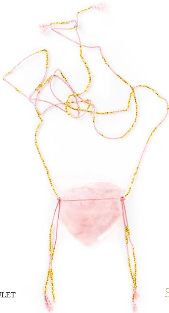
ROSE QUARTZ AMULET